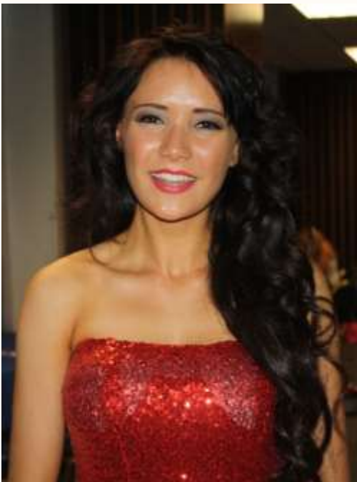
Miss England finalist wearing Kromé hair extensions

Being a salon partner of Kromé will benefit your business with our recognised brand and reputation.